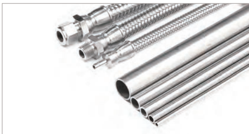
■ Metal Flexible ■ Hose & Tube