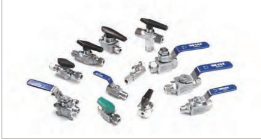
■ Ball & Plug Valves