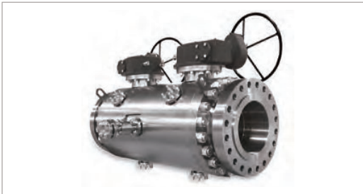
■ DBB Trunnion Side Entry ■ Ball Valves