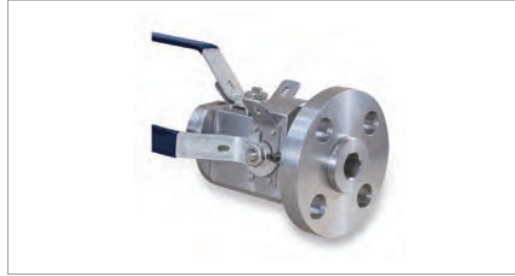
■ DBB Floating Split ■ Body Ball Valves