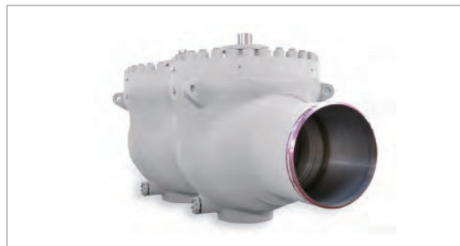
■ DBB Trunnion Top Entry ■ Ball Valves