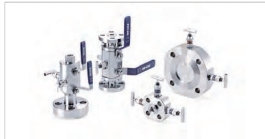
■ Block & Bleed Valves / Monoflange