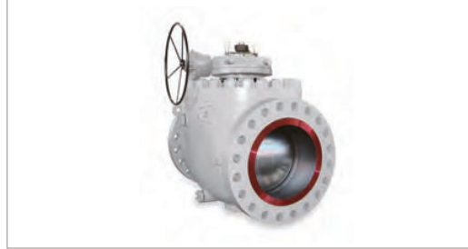
■ Trunnion Top Entry ■ Ball Valves