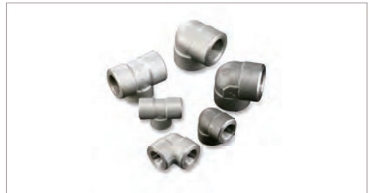
■ Hydraulic ■ Pipe Fittings