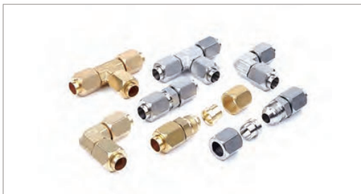
■ K Series JIC ■ Tube Fittings