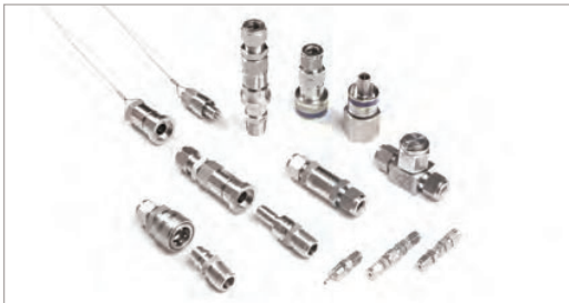
■ Quick Connect, Filters