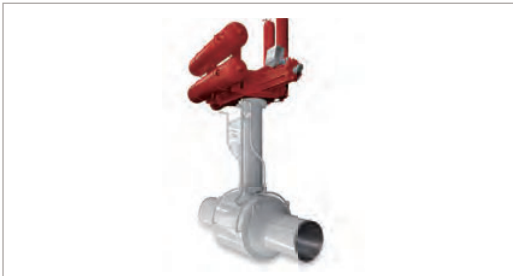
■ Trunnion Welded Body ■ Ball Valves