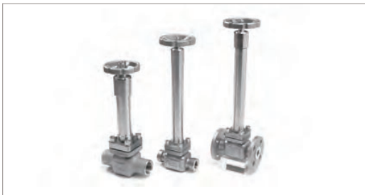
■ Cryogenic Valves