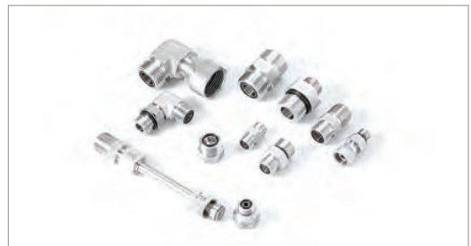
■ HD Series ■ O-Ring Face Seal Fittings