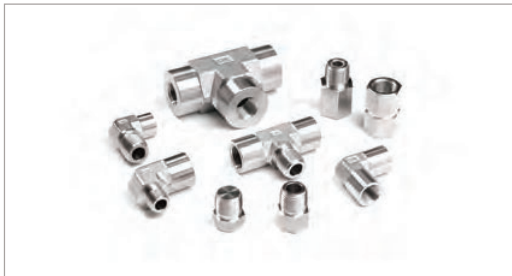
■ Instrumentation ■ Pipe & Weld Fittings