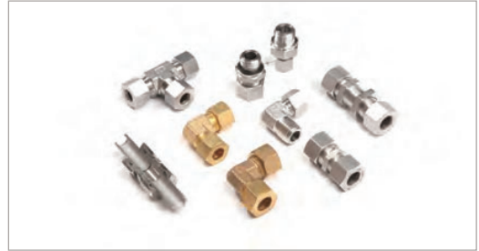
■ JIS Bite Type Tube Fittings (DIN/JIS)