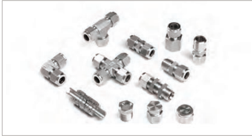
■ DK-Lok ■ Tube Fittings