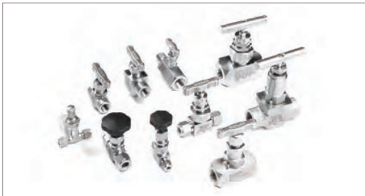
■ Metering, Needle & Regulator Valves