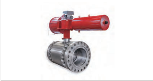
■ Trunnion Side Entry ■ Ball Valves