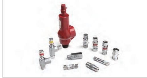
■ Check & Relief Valves